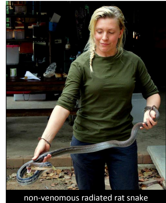
non-venomous radiated rat snake

Aotea, Great Barrier was home to me two years ago and I left with great sadness, for the Hawaiian surf and the rocky mountain snow. However, I have found myself back in this beautiful part of New Zealand and am looking forward to making a positive environmental impact where I can. With so many unique ecosystems which have become rare on the main